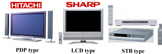
Figure 2 Status of Sale of Digital TV Products

0.5 million sets of 'all-in-one digital HDTV' were shipped in Japan by the end of 2003, and 2.5 million DTTB ready HDTV sets, which have HDTV display and DTTB STB interface, are on the market. The flat display panel (FDP) is becoming popular; the sale of LCD and PDP TV sets already surpass conventional CRT HDTV receivers. The demand for flat display panels will enhance the demand for DTTB, and the penetration speed will be accelerated.