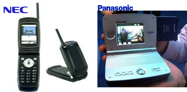
Figure 3 Broadcasting to Portable Terminals (sample)

Cellular phones and PDA are not the only solution for mobile reception. Coaches and trains need wider screens which are beyond cellular type resolution. For this purpose, research is being conducted to receive HDTV in 12 segments of 64QAM signal. The HDTV reception in a vehicle travelling below 60km/h is attained by using active array antenna on the window of the vehicle. Experiments are examined on the Doppler equivalent technique against the multi-path Doppler frequency shift while moving at the 100km high speed. The demonstration of HDTV reception on coaches will be provided at the ITS World Conference in October 2004 in Nagoya, Japan.